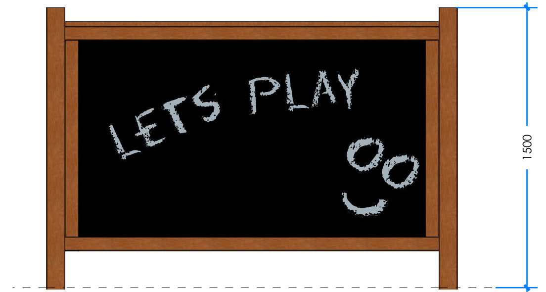
2 ELEVATION Scale: 1:20

** This drawing and the information on it remains the property of lyPa Pty Ltd. Written permission must be obtained from lyPa Pty Ltd to copy or produce the whole or part of this drawing or product.