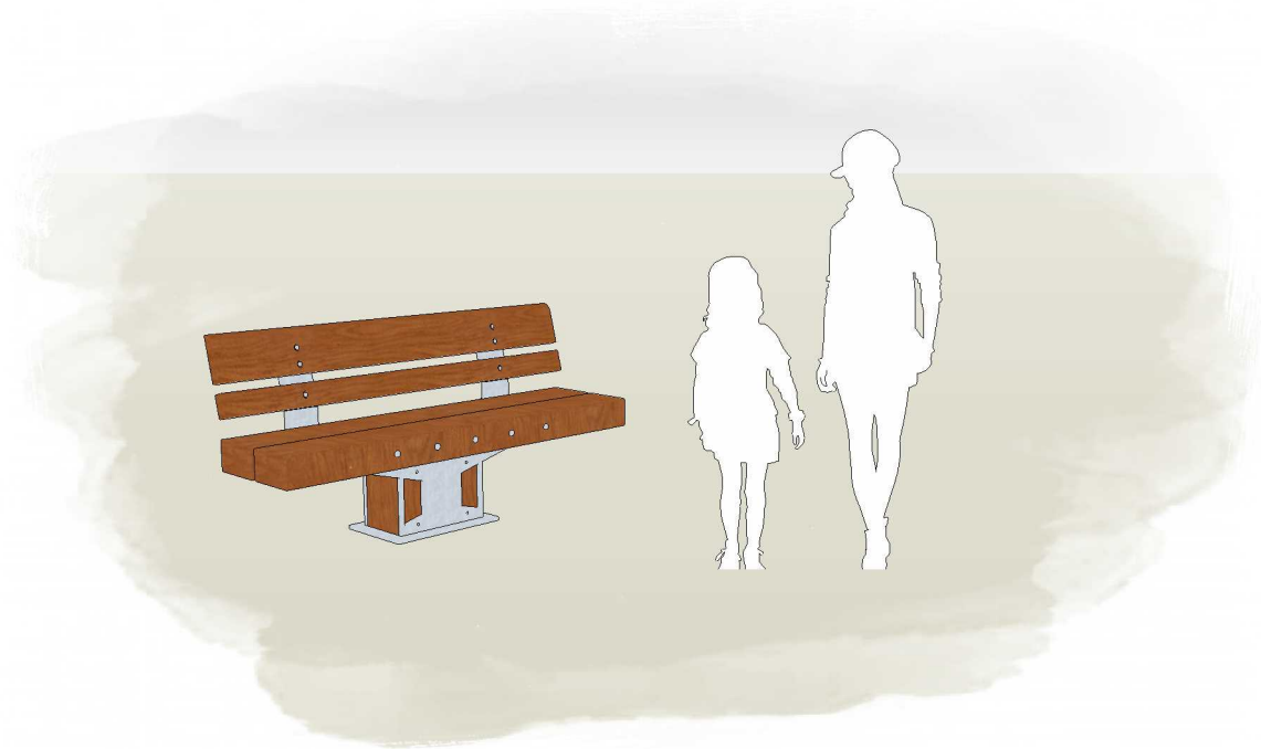
1 PERSPECTIVE Scale: NTS

Category: SEATS & FURNITURE Name: CHUNKY BENCH WITH BACK 500H Code: L018503 Free Height of Fall: NA mm