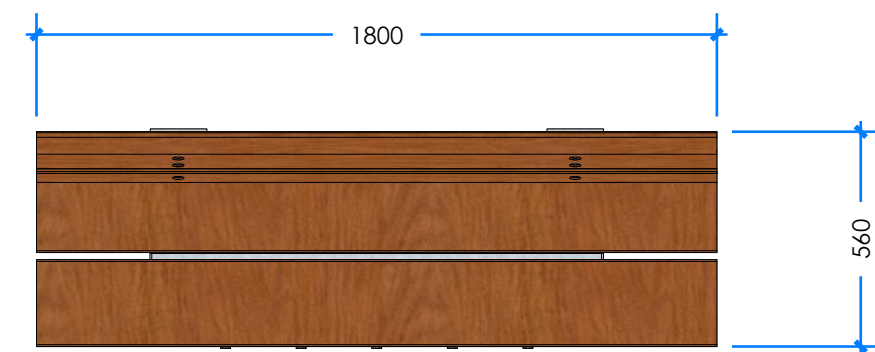
3 TOP Scale: 1:20