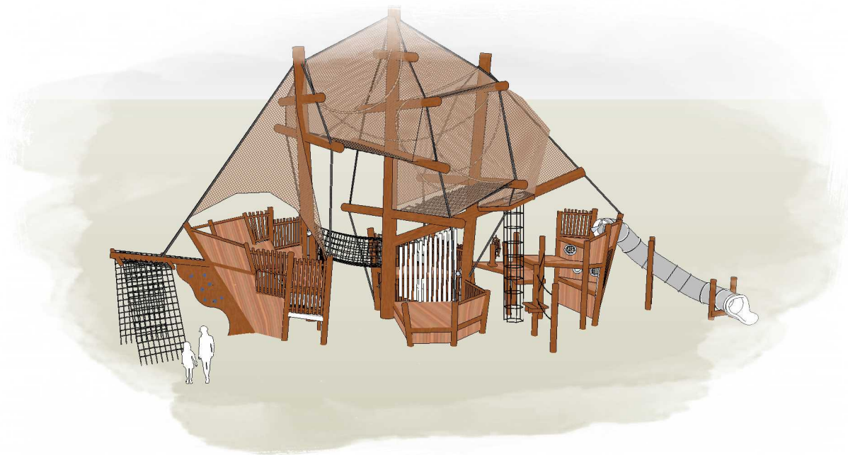
1 PERSPECTIVE Scale: 1;150

* Most Lypa products are hand-crafted so actual dimensions may vary. Please advise of particular requirements or constraints to be accommodated.