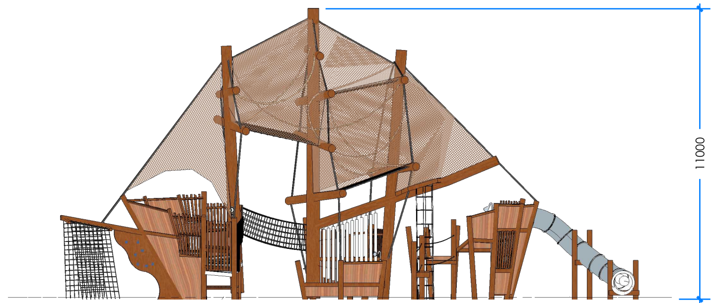
2 ELEVATION Scale: 1;150

** This drawing and the information on it remains the property of lyPa Pty Ltd. Written permission must be obtained from lyPa Pty Ltd to copy or produce the whole or part of this drawing or product.