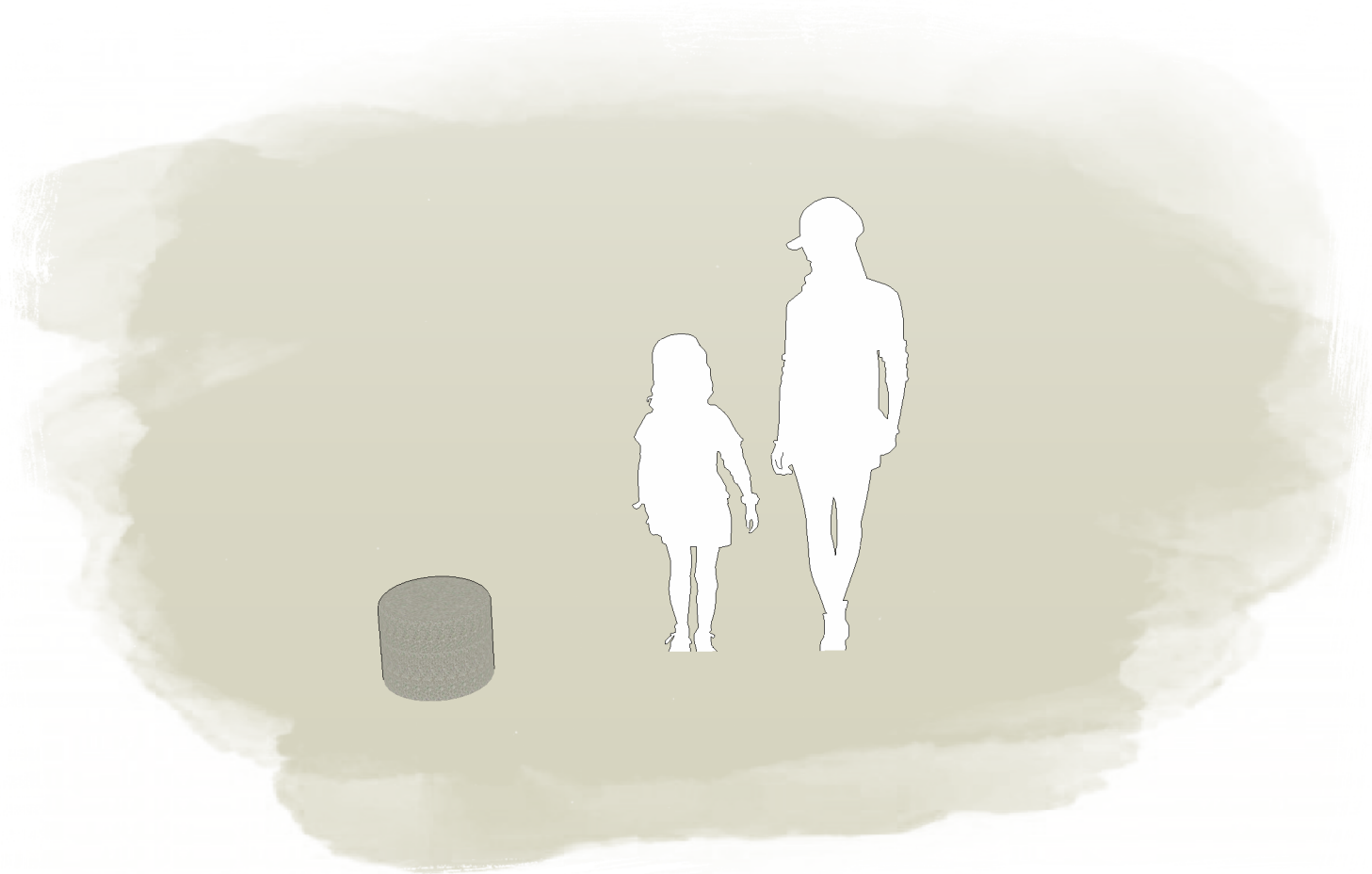
1 Perspective Scale: NTS

Code: L010500 Category: JOURNEY PATHWAYS & MOVEMENT Free Height of Fall: NA