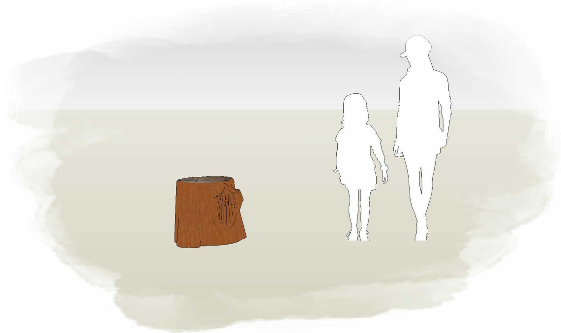
1 PERSPECTIVE Scale: NTS

* Most Lypa products are hand-crafted so actual dimensions may vary. Please advise of particular requirements or constraints to be accommodated.