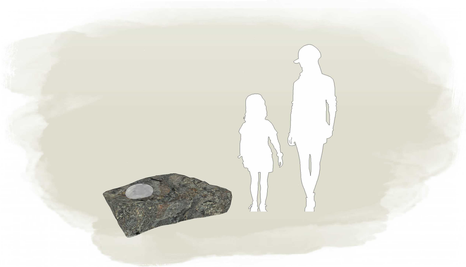
1 PERSPECTIVE Scale: NTS

* Most Lypa products are hand-crafted so actual dimensions may vary. Please advise of particular requirements or constraints to be accommodated.