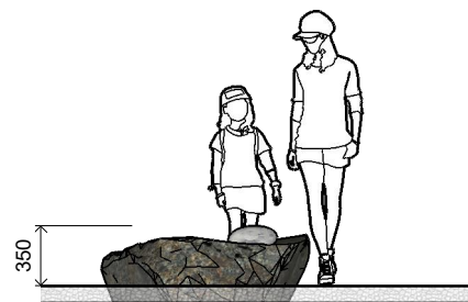
2 Front View Scale: 1:50