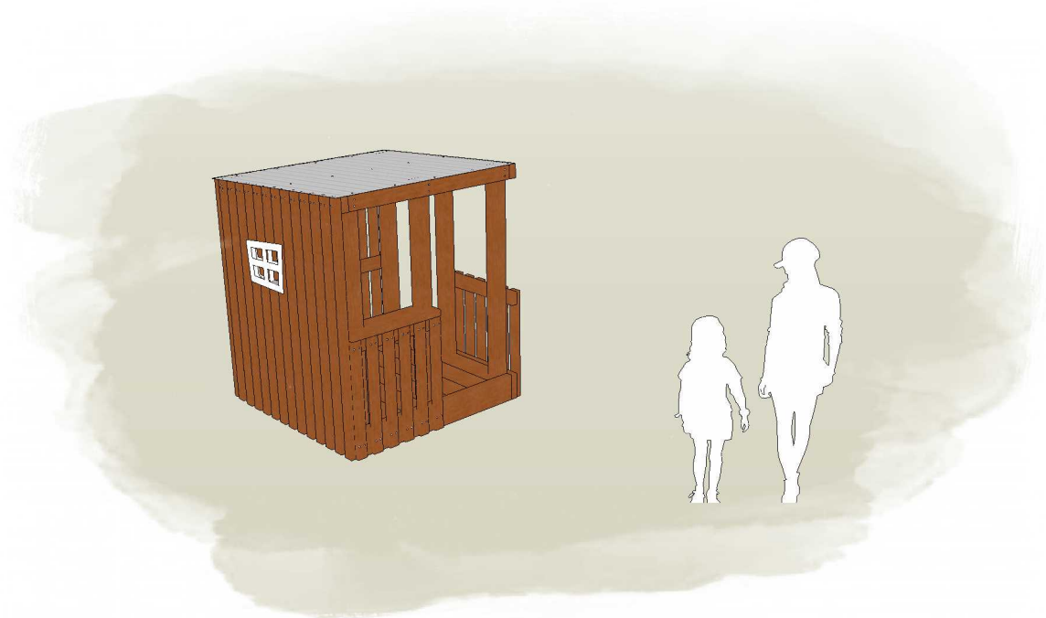
1 PERSPECTIVE Scale: NTS

* Most Lypa products are hand-crafted so actual dimensions may vary. Please advise of particular requirements or constraints to be accommodated.