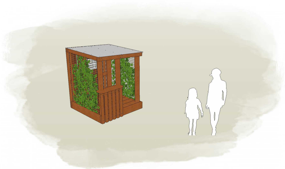
1 PERSPECTIVE Scale: NTS