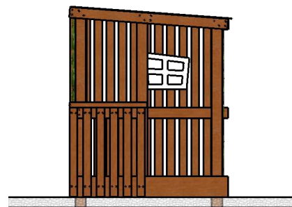
2 Front View Scale: 1:50