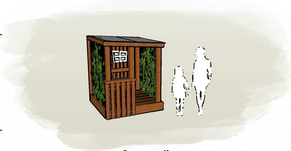
1 Perspective Scale: NTS

Length: 1,500 Width: 1,500 Height: 1,800