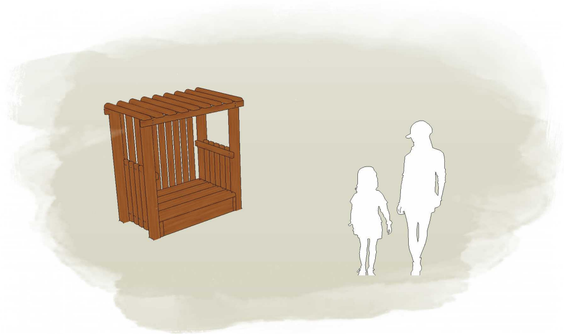
1 PERSPECTIVE Scale: NTS

* Most Lypa products are hand-crafted so actual dimensions may vary. Please advise of particular requirements or constraints to be accommodated.