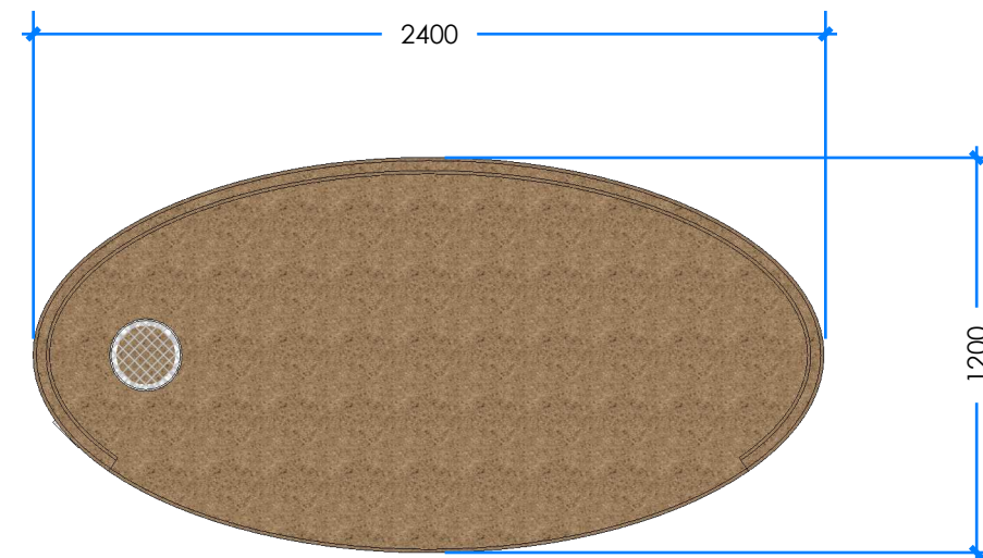
3 TOP Scale: 1:25

* Most Lypa products are hand-crafted so actual dimensions may vary. Please advise of particular requirements or constraints to be accommodated.