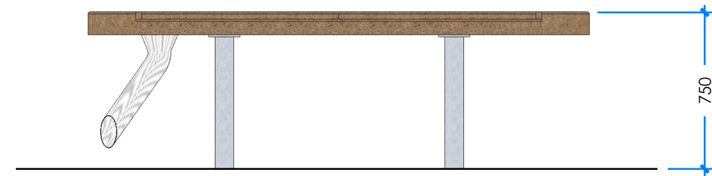
2 ELEVATION Scale: 1:25