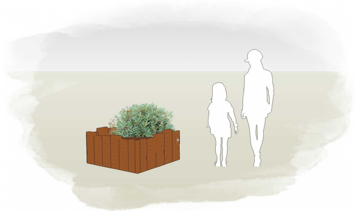
1 PERSPECTIVE Scale: NTS

* Most Lypa products are hand-crafted so actual dimensions may vary. Please advise of particular requirements or constraints to be accommodated.