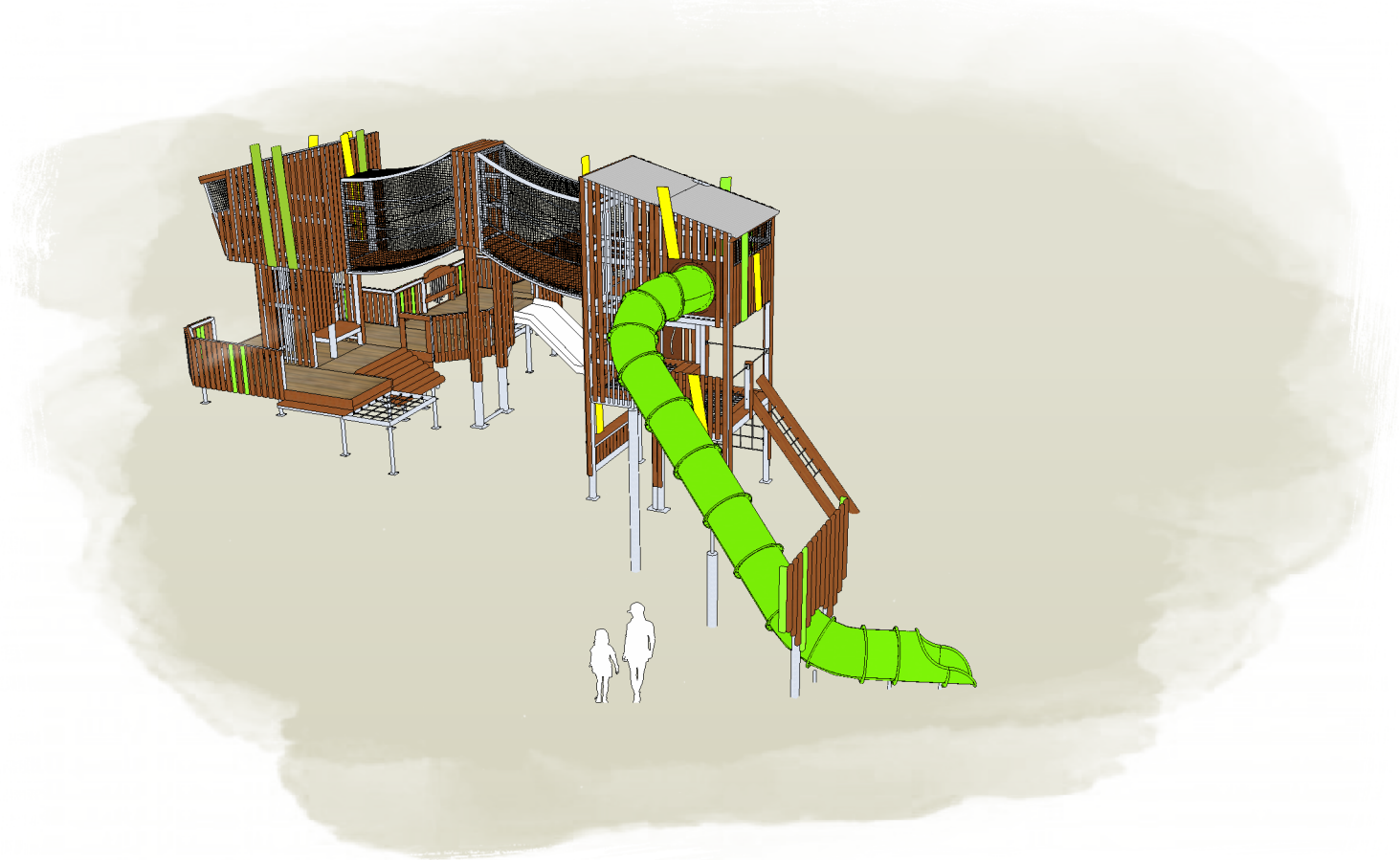
1 Perspective Scale: NTS