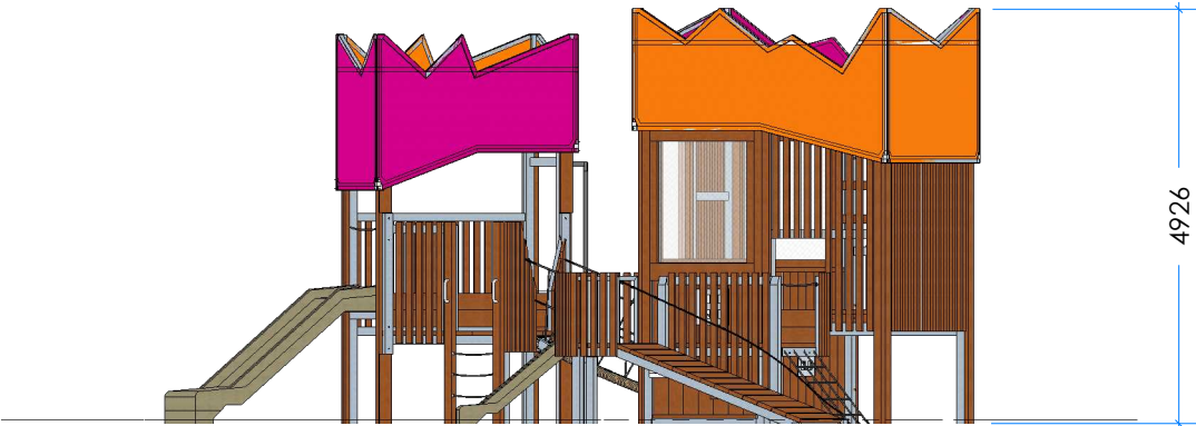
2 Elevation Scale: 1:100