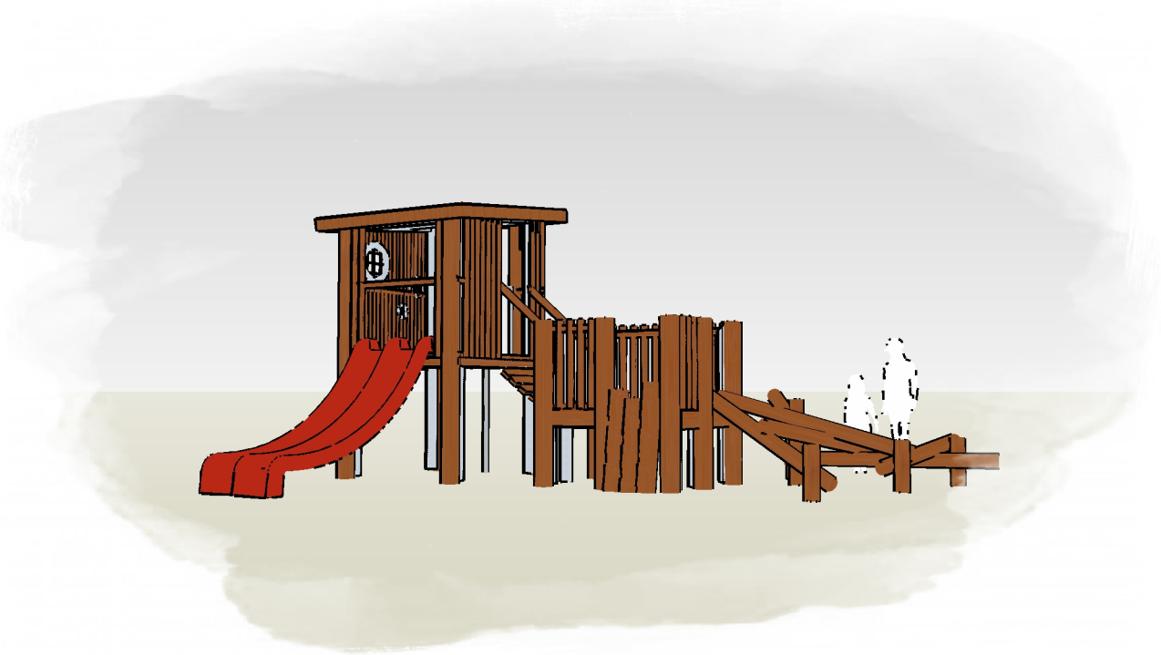
1 PERSPECTIVE Scale: NTS

Category: ELEVATED PLAY Name: EDGE TOWER WITH DOUBLE SLIDE AND LOG SCRAMBLE Code: L009901 Free Height of Fall: 1,500 mm